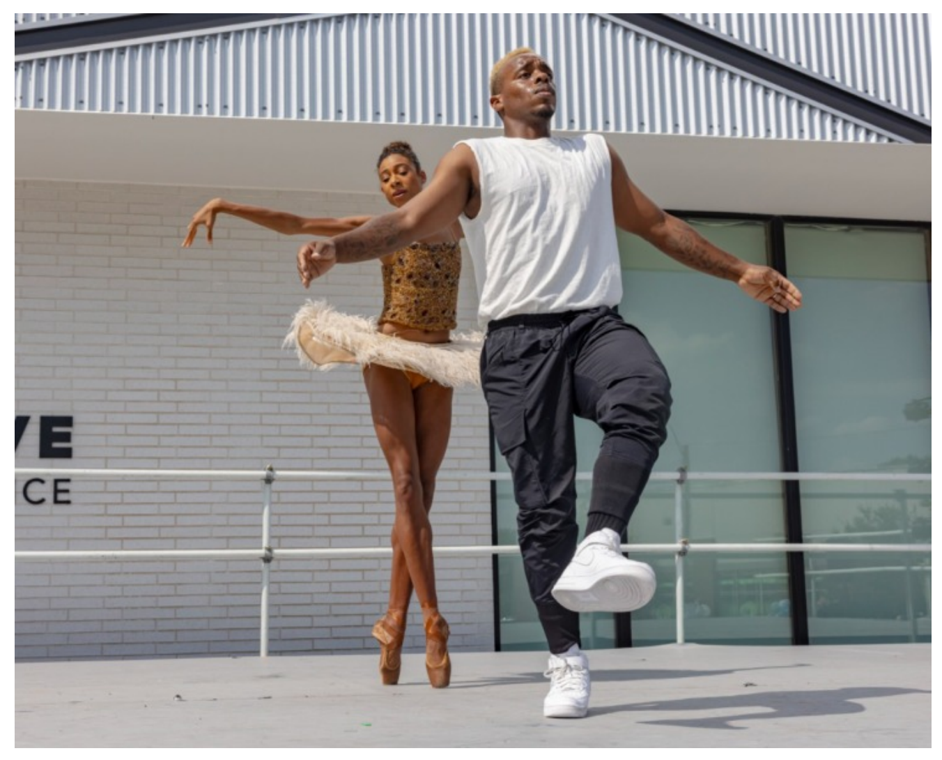
Memphis Jookin dance celebrity Lil' Buck (front) and Adji Cissoko of the Alonzo King Lines Ballet of San Francisco perform variations of the dying swan from "Swan Lake" Saturday at Collage Dance Collective at 505 Tillman St.

By The Daily Memphian Staff, Daily Memphian Updated: September 16, 2023 8:20 PM CT | Published: September 16, 2023 8:20 PM CT