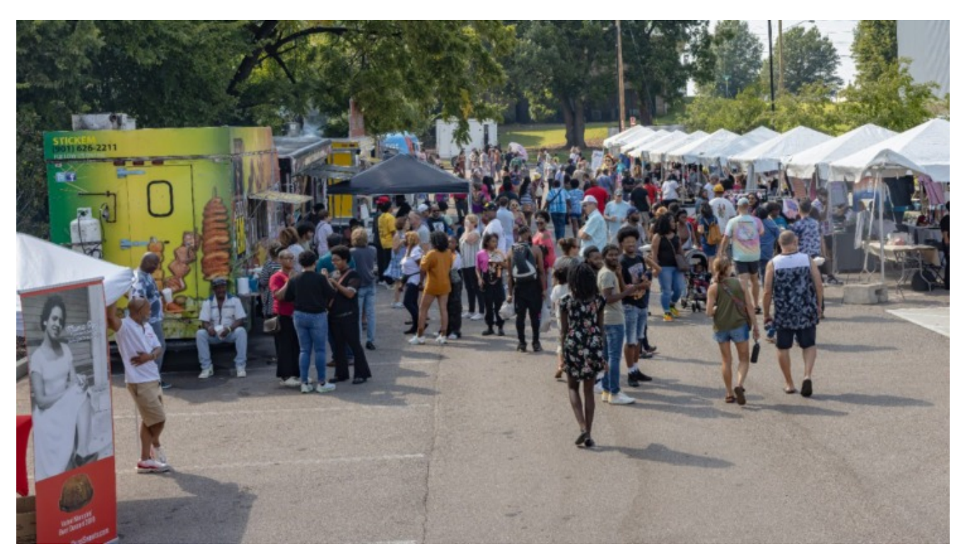
Food and vendors added to the fun at the Collage Dance Collective's third annual Memphis Dance Festival in Binghampton on Saturday, Sept. 16, 2023.