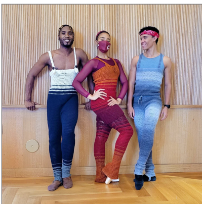
Fabulous Crochet warm-up clothing.